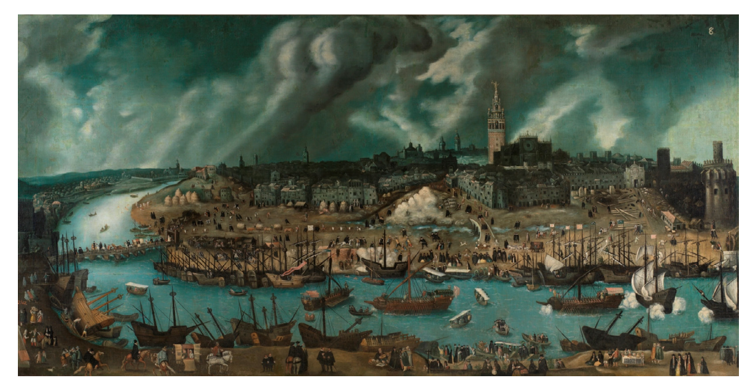
Illustration 2 Alonso Sánchez Coello (attributed), View of Seville, ca. 1570, oil on canvas, Museo del Prado, Madrid.